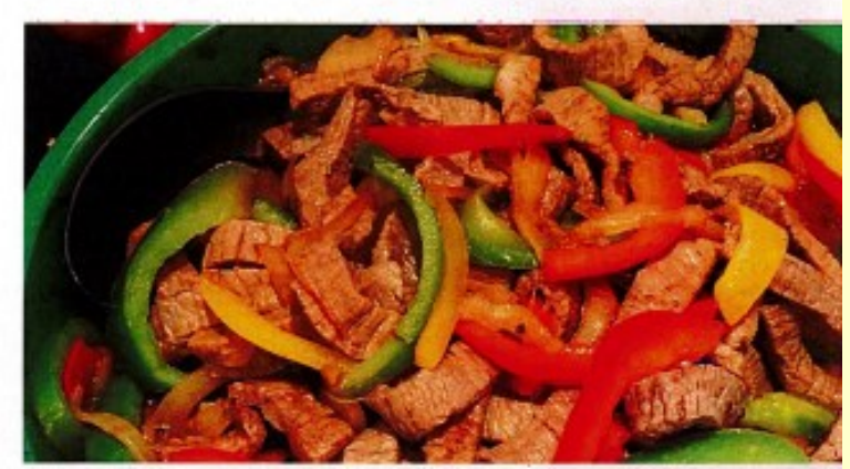
© Dietitians of Canada 2016, www.dietitians.ca/IndigenousRecipes All rights reserved. May be reproduced for educational turboses.